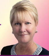
RI President 2022-23